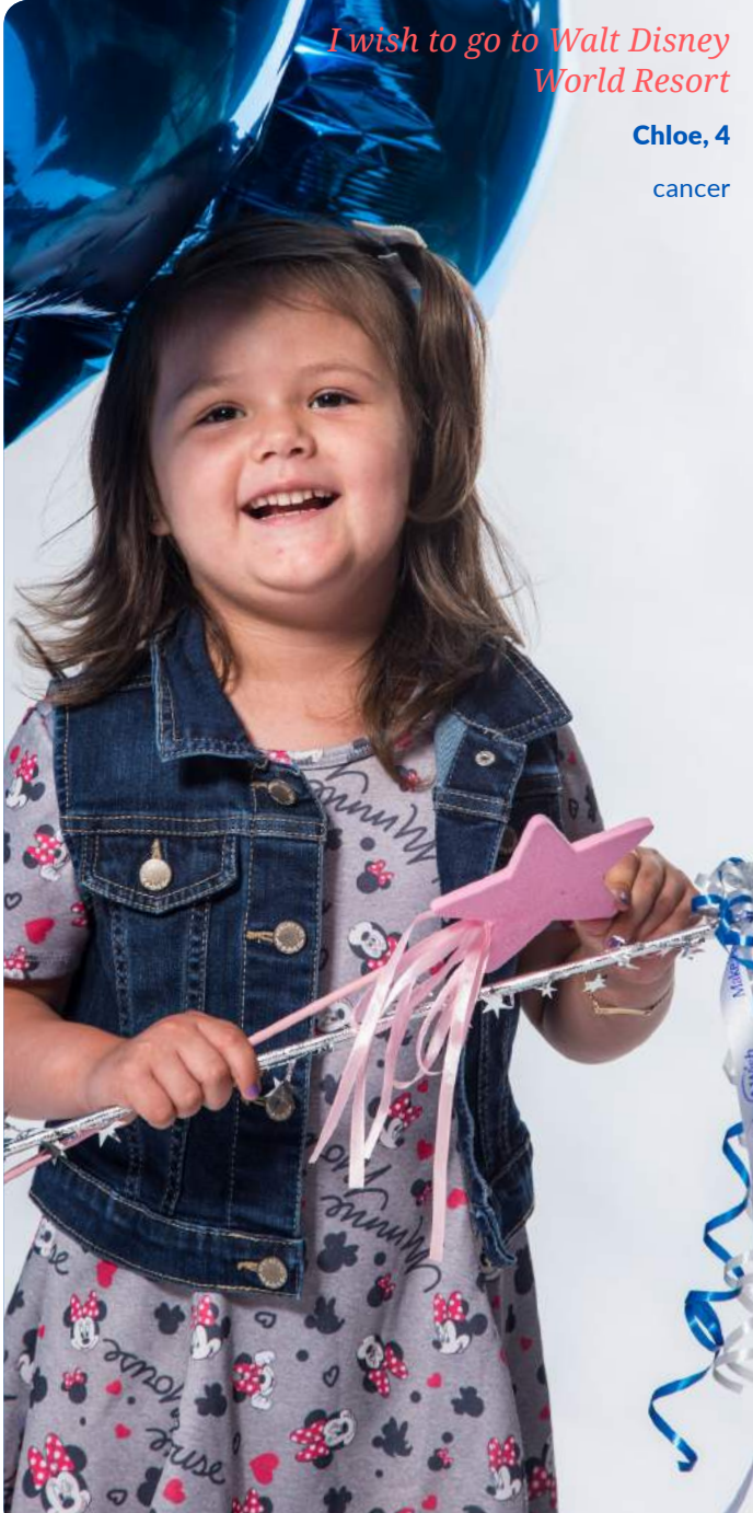
I wish to go to Walt Disney World Resort